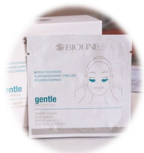
Gentle Daily Ritual Eye Patch

DeOx Eye and Lip, and AGE Beauty Secret Eye and Lip are also some favorites of our educators. Be Creative! Create your own solution for Details of Beauty alternatives, and share with us your favorites!