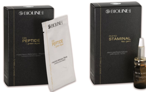
DETAILS OF BEAUTY, Buy 1, Get 1 FREE

"The Way to Achieve Your Own Success is to be Willing to Help Somebody Else Get their Success First " Iyanla VanZant