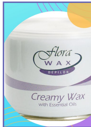
Flora Wax, Buy 1 Can, Get Applicators FREE!