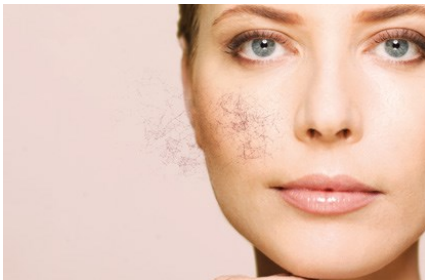
DeSense Instant Relief, Suitable for all skin types

The exclusive skincare line that treats skin Hypersensitivity, thanks to the triple combined action of innovative formulations